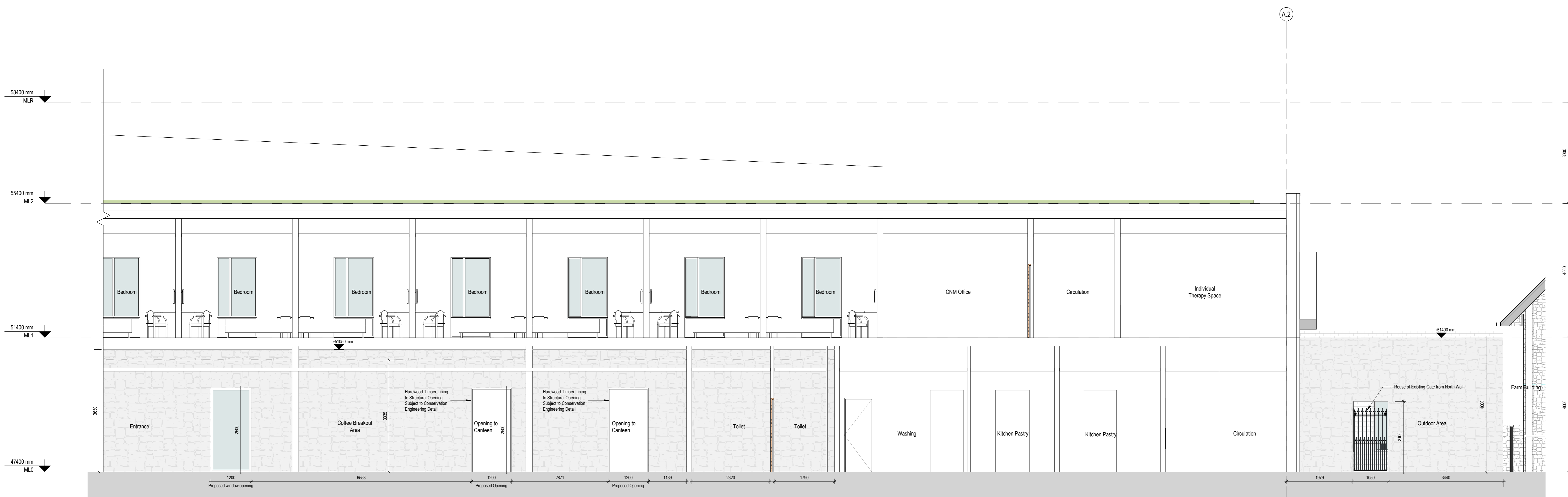
2 Section East Internal Historic East Wall - Zone 2 Scale: 1 : 50

COPYRIGHT: The design and details shown on this drawing are applicable to the Named Project only and may not be reproduced, modified or relied in whole or part to be used for any other project or purpose without the prior written permission of TOT Architects with whom copyright resides. DO NOT SCALE: This drawing (use figured dimensions only). The Contractor is responsible for checking all levels and dimensions on site prior to commencement of works. Any discrepancies are to be referred to the ARCHITECT. Drawings to be read in conjunction with all other Consultative Drawings & Specifications were relevant. Proprietary items shall be fixed in strict accordance with the Manufacturer's instructions. Sizes of proprietary items shall be checked with Manufacturer.